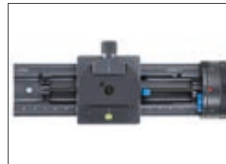
CASTEL-M_09.jpg Mechanical Focusing Rail CASTEL-M for magnification factors up to 5:1, Top view