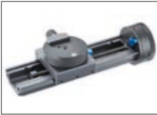
CASTEL-M_01.jpg Mechanical Focusing Rail CASTEL-M for magnification factors up to 5:1