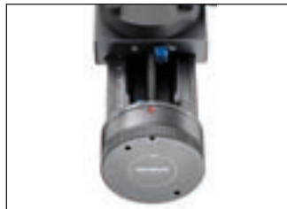
CASTEL-M_11.jpg Mechanical Focusing Rail CASTEL-M for magnification factors up to 5:1, Focus wheel- detail