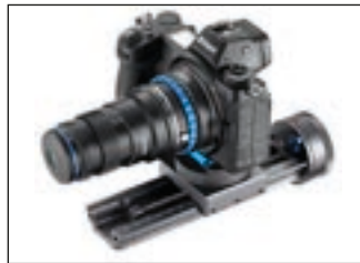
CASTEL-M_05.jpg Mechanical Focusing Rail CASTEL-M with Nikon Z6 and LAOWA 25mm f/2,8 Ultra Macro 2,5-5x for Nikon at NIKZ/NIK Lens Adapter