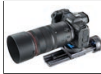
CASTEL-M_03.jpg Mechanical Focusing Rail CASTEL-M with Canon EOS R5 and RF 100mm F2.8 L Macro IS USM