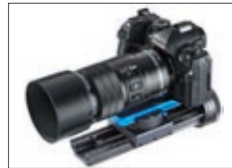
CASTEL-M_06.jpg Mechanical Focusing Rail CASTEL-M with OM-SYSTEM OM-1 and M.Zuiko ED 90mm F3.5 Macro IS PRO