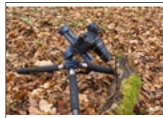
ZRT3853.jpg CASTEL-M on TrioPod-M with MagicBall, Nikon Mirrorless camera and Laowa 25mm f/2.8 2.5-5x Ultra Macro lens