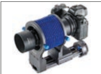
CASTEL-M_07.jpg Mechanical Focusing Rail CASTEL-M with Bellows Attachment CASTBAL-PRO to employ Focus Stacking in Product- and Studio Photography, Camera and lens