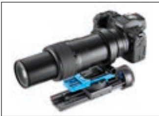
CASTEL-M_04.jpg Mechanical Focusing Rail CASTEL-M with Canon EOS R and Canon MP-E 65mm f/2.8 1-5x Macro Photo at EF-EOS R Lens Adapter