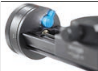
CASTEL-M_10.jpg Mechanical Focusing Rail CASTEL-M for magnification factors up to 5:1, Lever for setting magnification factors