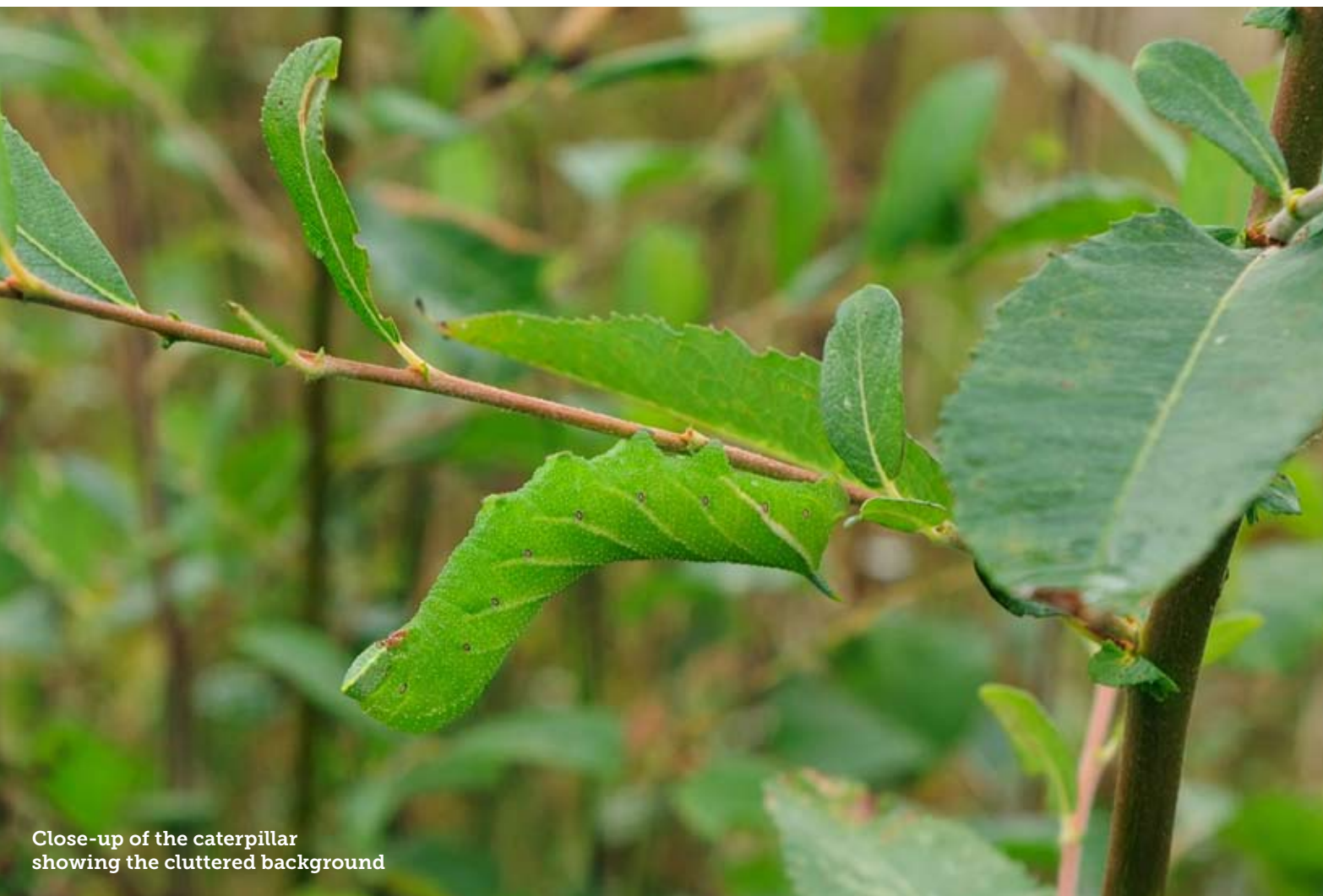
Close-up of the caterpillar showing the cluttered background