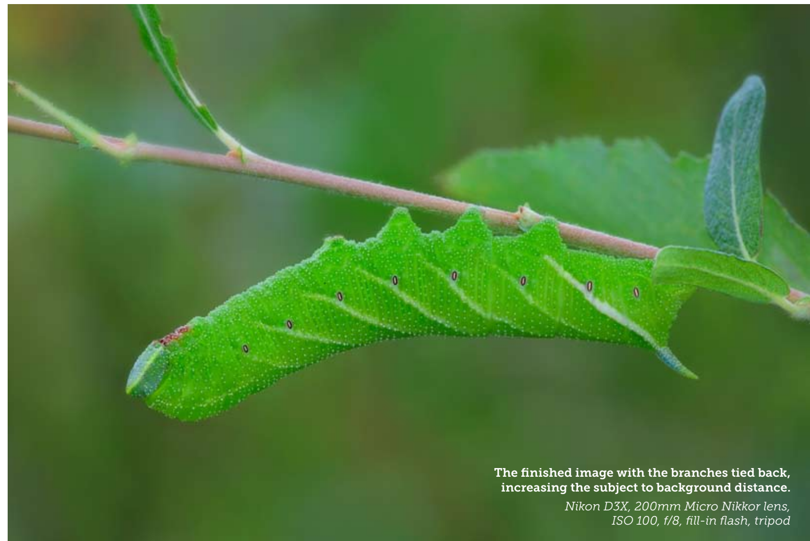
The finished image with the branches tied back, increasing the subject to background distance.

Nikon D3X, 200mm Micro Nikkor lens, ISO 100, f/8, fill-in flash, tripod